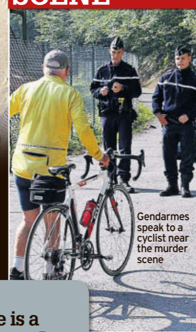
Gendarmes speak to a cyclist near the murder scene

“There is a cover-up. I think they know who is behind it, who is the gunman