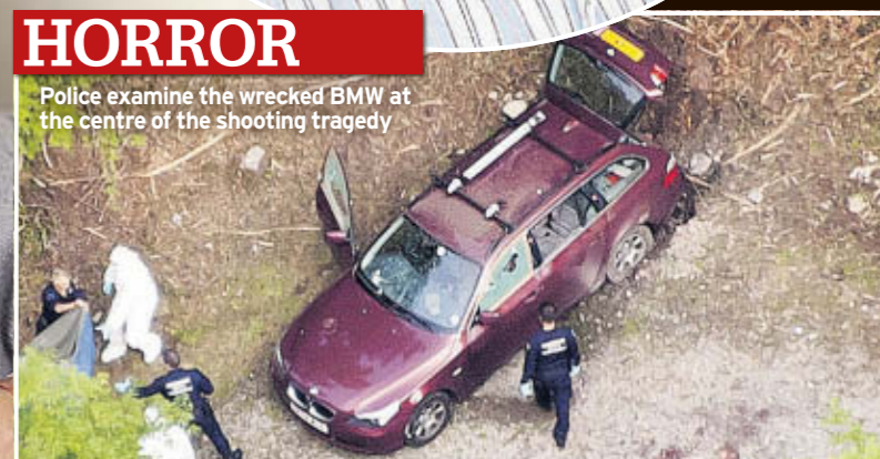
Police examine the wrecked BMW at the centre of the shooting tragedy

It's lies and nonsense ...If police want to quiz me they can come here