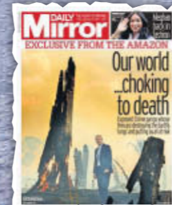
CHOKING Mirror report from burning Amazon