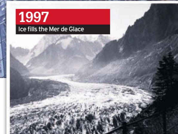
1997 Ice fills the Mer de Glace