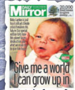
GREEN Special issue on impending climate doom