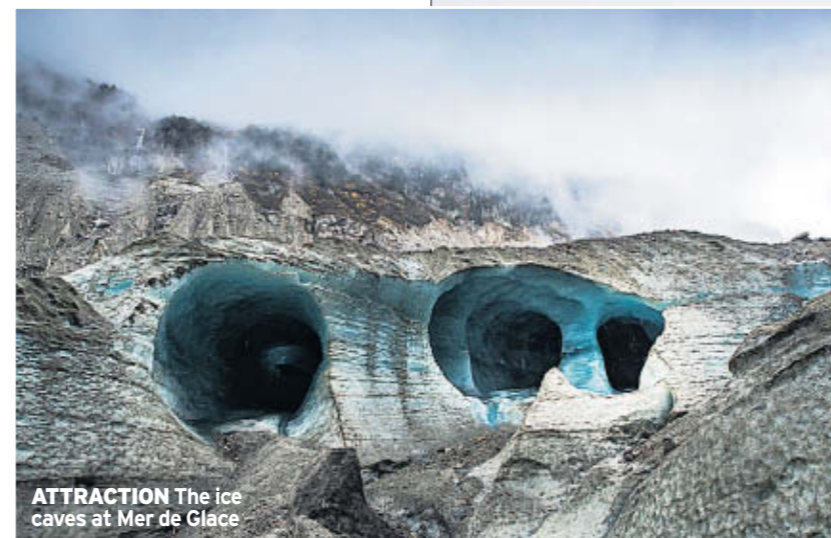
ATTRACTION The ice caves at Mer de Glace