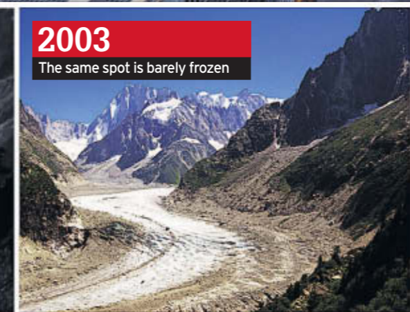
2003 The same spot is barely frozen