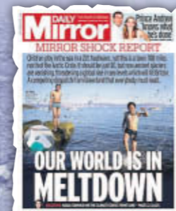
WARMING Kids swim in Arctic Circle heatwave

In 2015 ice on the glacier reached this point of cliff