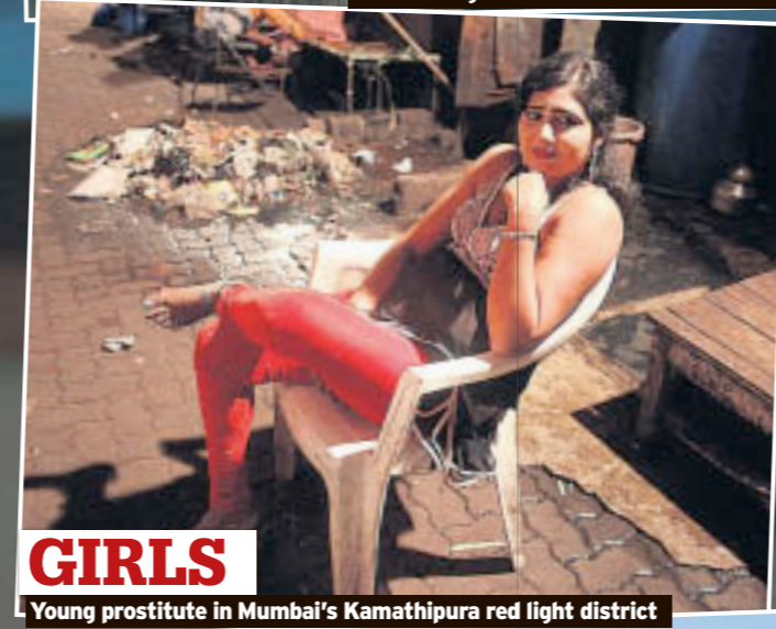
GIRLS Young prostitute in Mumbai's Kamathipura red light district