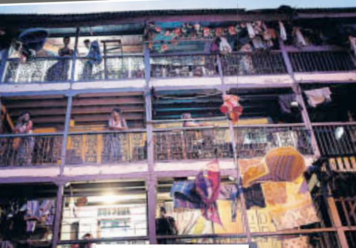
BROTHEL One of city's oldest... others have under-age girls hidden away

attacked me, molested me. I had no idea what was happening. I was completely petrified.