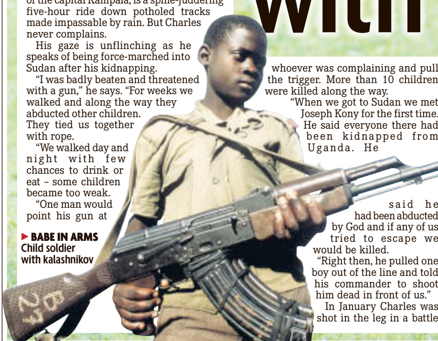
► BABE IN ARMS Child soldier with Kalashnikov