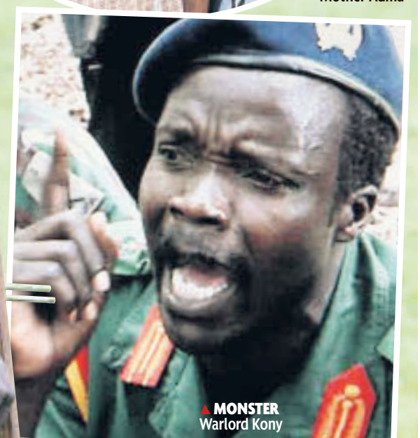
▲ MONSTER Warlord Kony